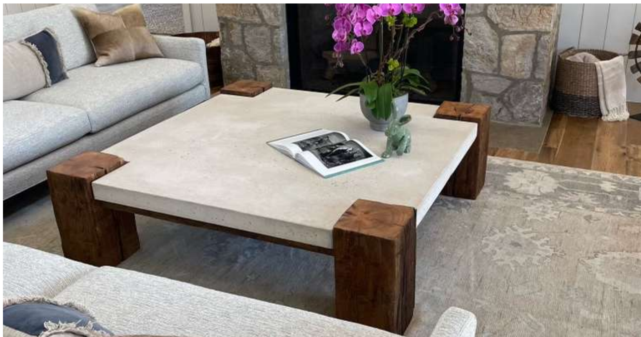
Shown in Wheat Vals Stone with NV finish