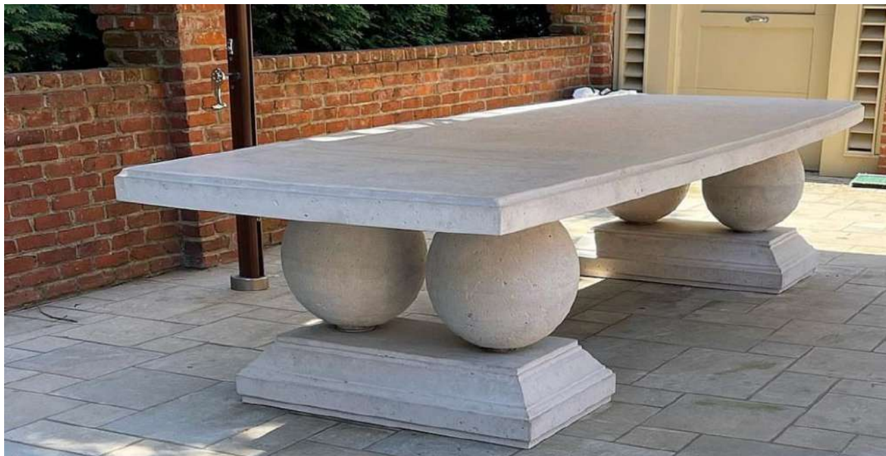
Shown in Alps White Vals Stone with NV finish