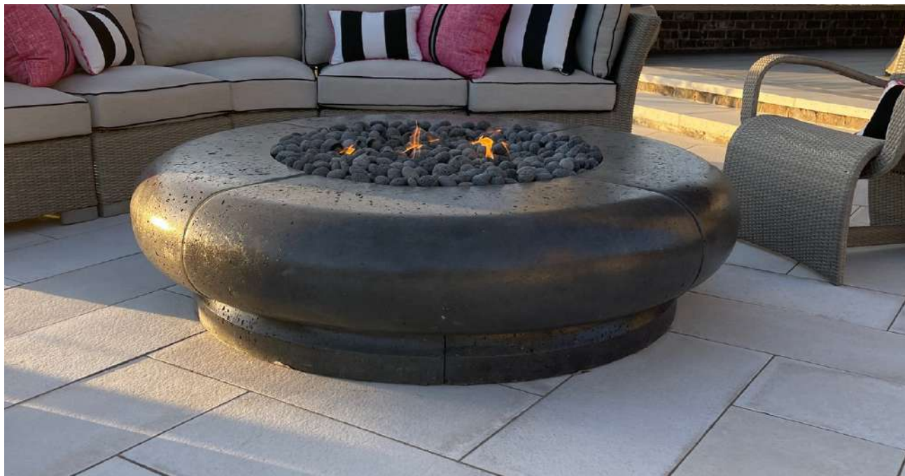
Shown in Onyx Vals Stone with NV gloss finish