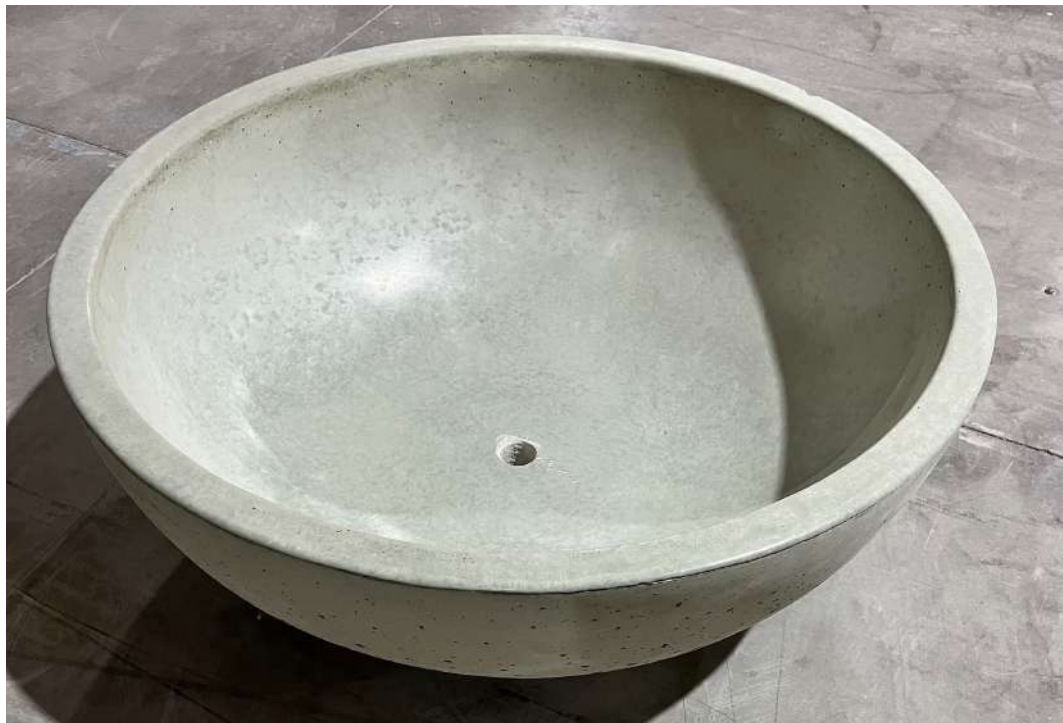
Shown in Vals Stone Kiawah Green with NV finish