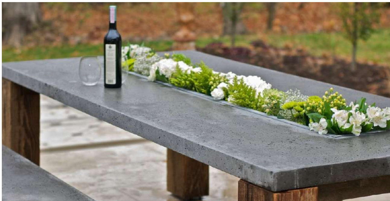
Shown in Onyx Vals Stone with NV finish