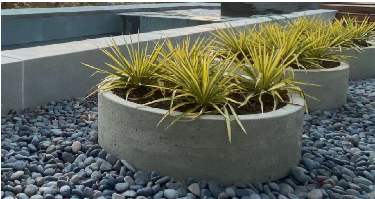
Shown in premium color, Kiawah green Vals Stone with NV finish