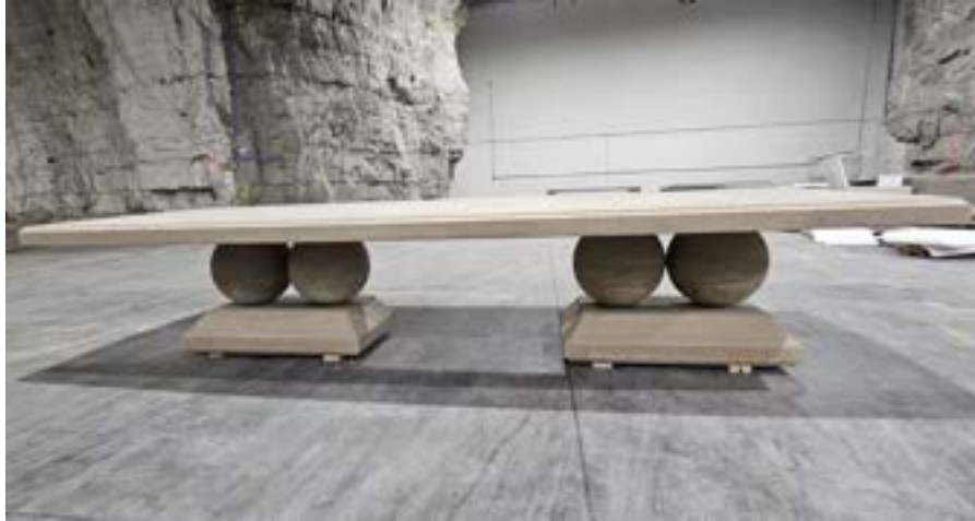
Shown in Alps White Vals Stone with NV finish 151125032 NV