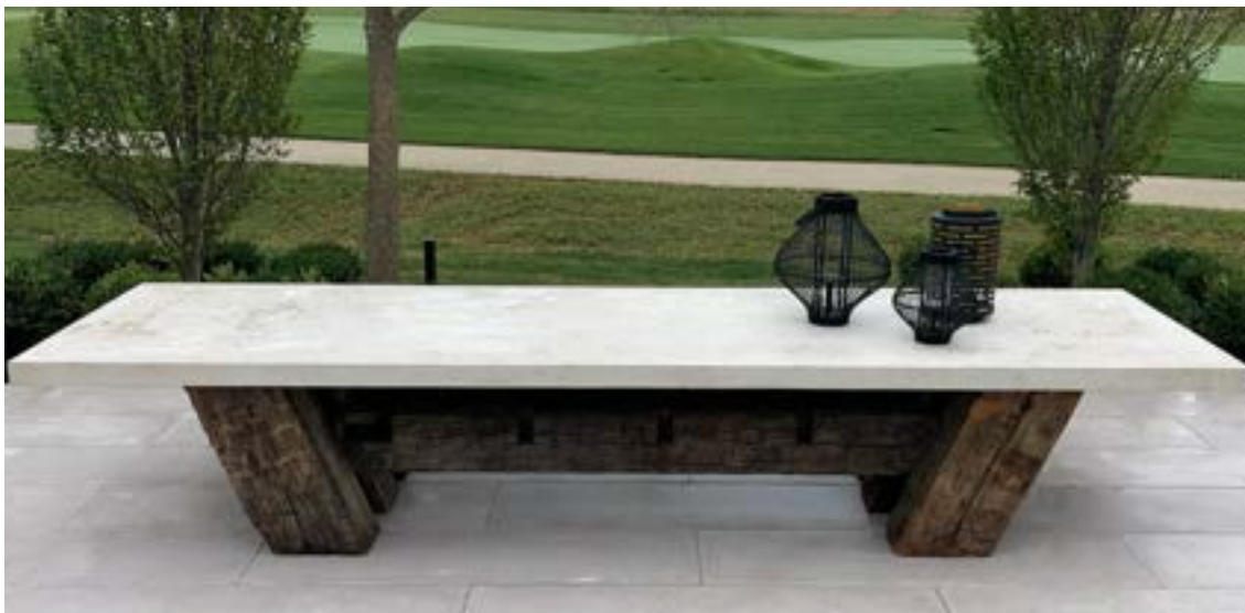
Shown in Alps White Vals Stone with NV finish