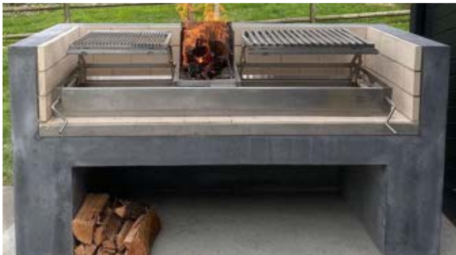
Shown in Onyx Vals Stone with Kincho Grill https://kinchogrills.com