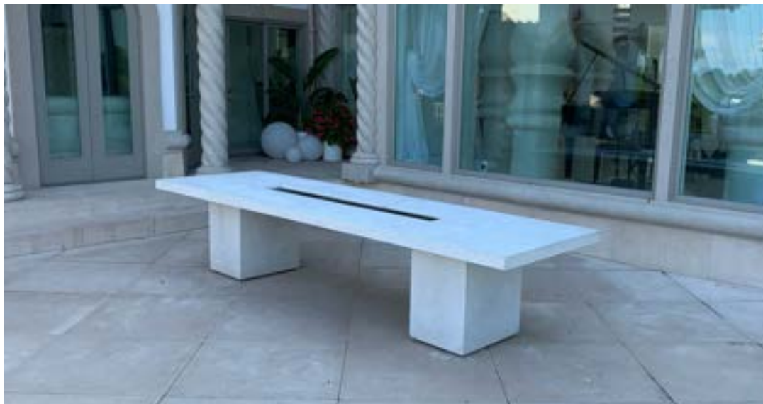
Shown in Glacier Vals Stone with NV finish