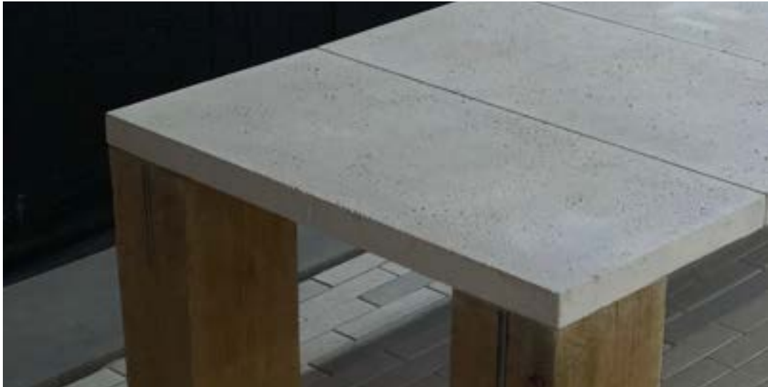
Shown in Alps White Vals Stone with NV finish