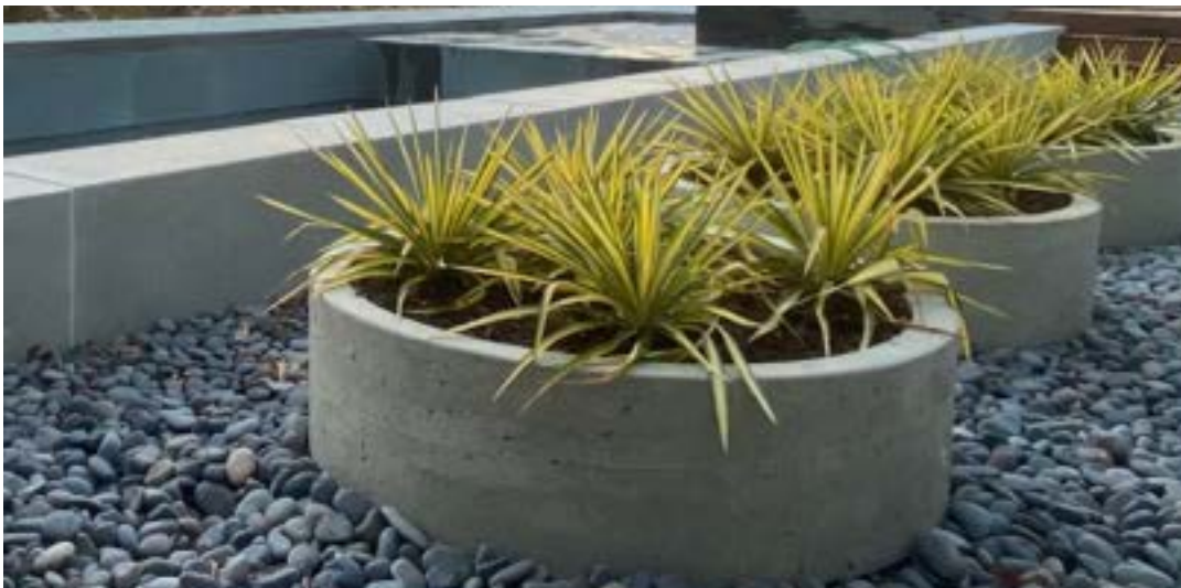
Shown in premium color, Kiawah green Vals Stone with NV finish