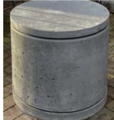
Shown in Soft Gray Vals Stone with NV finish