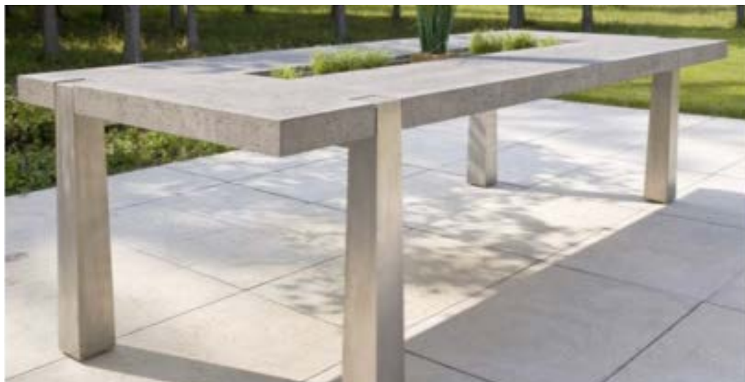
Shown in Soft Gray Vals Stone with NV finish