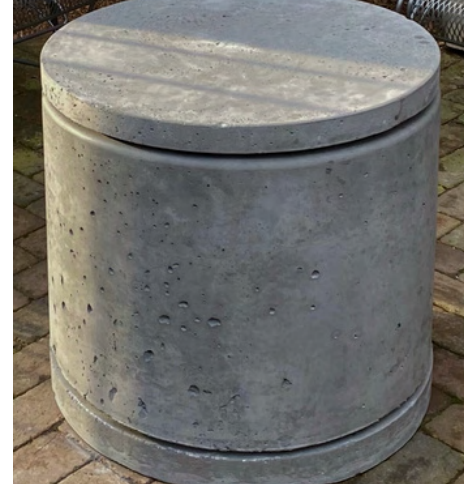
Shown in Soft Gray Vals Stone with NV finish