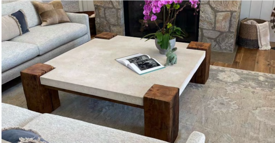
Shown in Wheat Vals Stone with NV finish