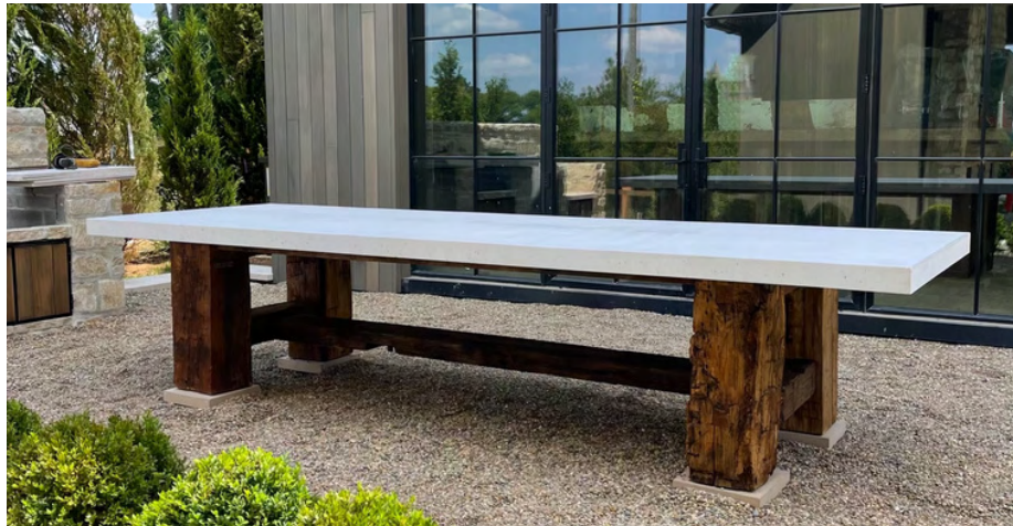
Shown in Alps White Vals Stone with NV finish