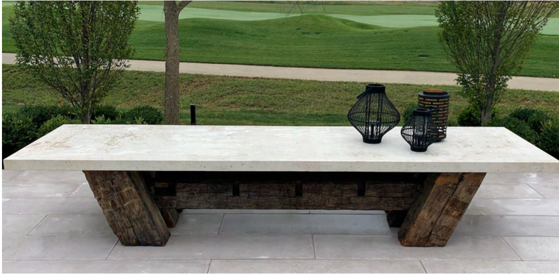
Shown in Alps White Vals Stone with NV finish