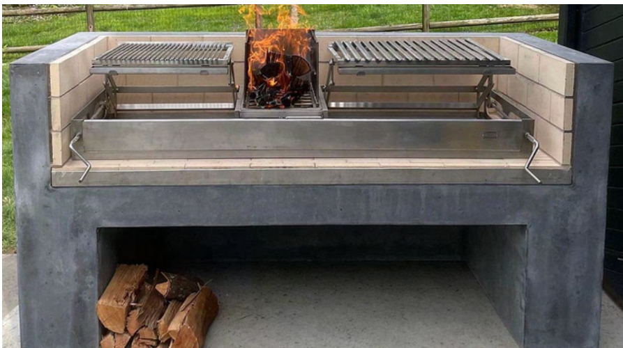
Shown in Onyx Vals Stone with Kincho Grill https://kinchogrills.com