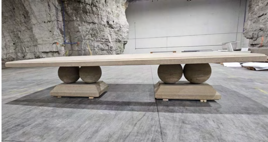
Shown in Alps White Vals Stone with NV finish 151125032 NV