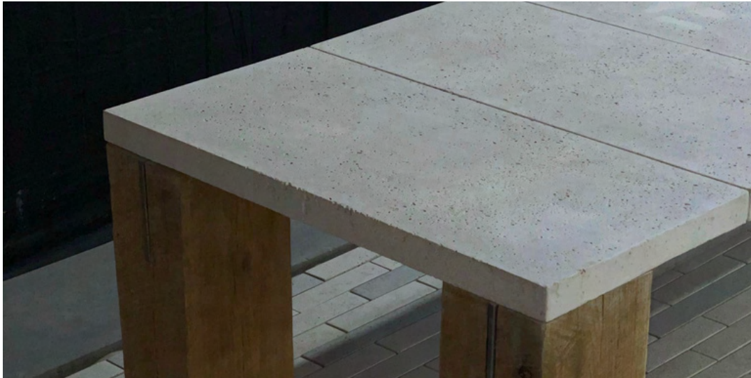
Shown in Alps White Vals Stone with NV finish