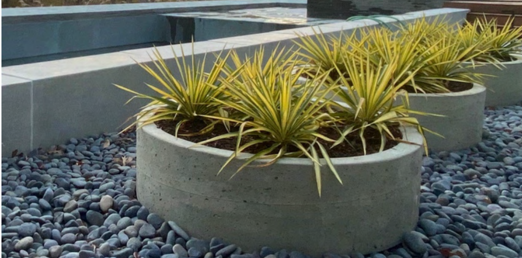
Shown in premium color, Kiawah green Vals Stone with NV finish