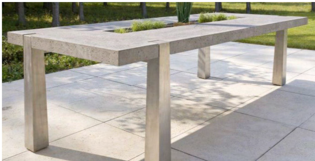
Shown in Soft Gray Vals Stone with NV finish